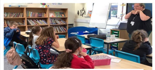
Y3-Y6 – Makaton (Sign Language)