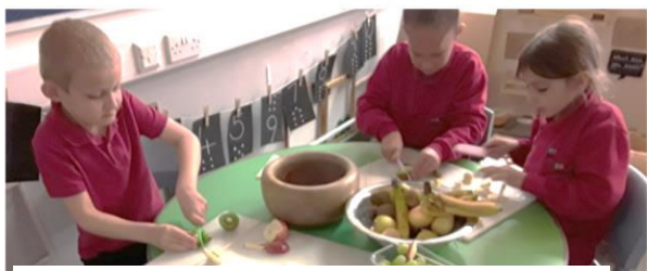
Y1/Y2 – Making Fresh Foods