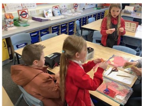
Y1/Y2 – Sewing