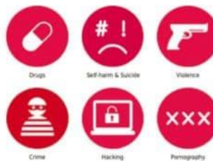
A Parent's Guide to Privacy Settings