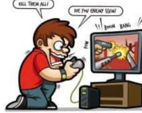
A Parent's Guide to Gaming