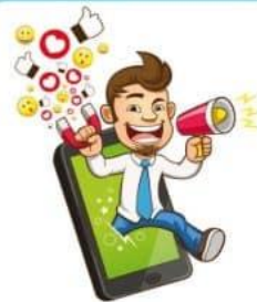
A Parent's Guide to Live Streaming

scan the QR code with your phone's camera to see the guides on our website