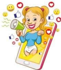
A Parent's Guide to Online Influencers