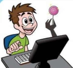
A Parent's Guide to Online Grooming