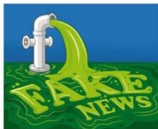
A Parent's Guide to Fake News