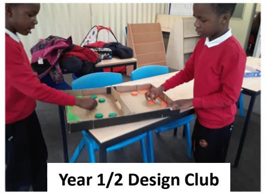
Year 1/2 Design Club